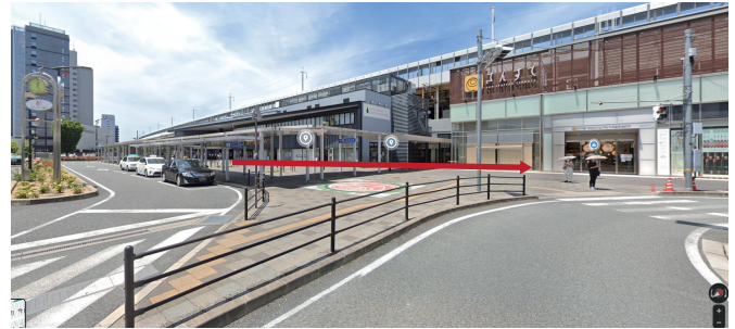
Leave Fukuyama Station "South Exit" and proceed to the left.